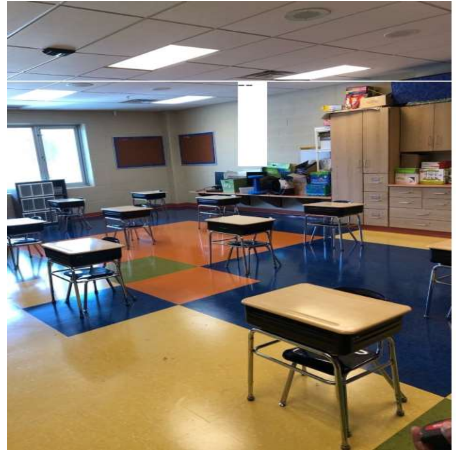
Office Area & Classroom Setup